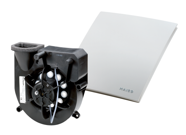
ER-UP.. recessed-mounted housing