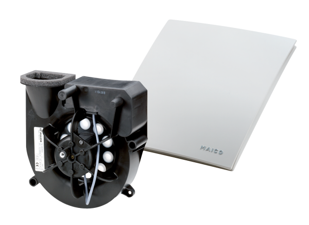
ER-UP.. recessed-mounted housing