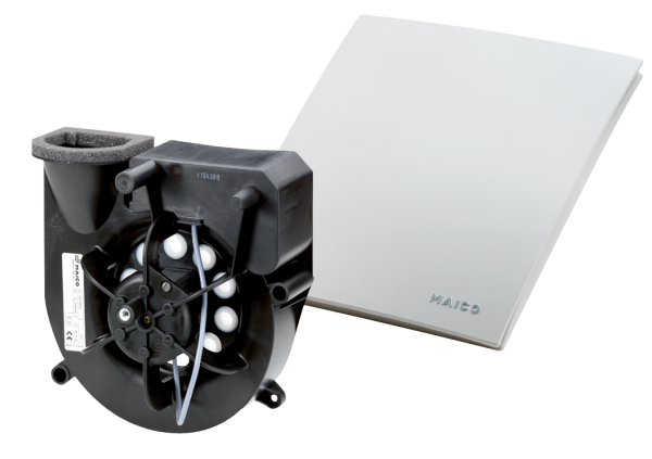
ER-UP.. recessed-mounted housing